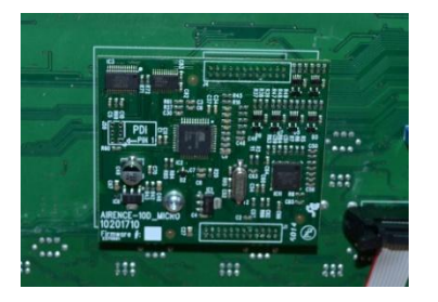
Figure 1 USB pcb